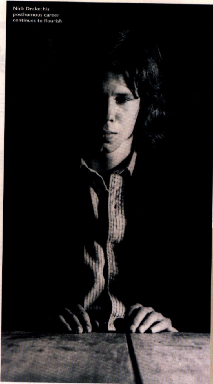
Nick Drake: his posthumous career continues to flourish

"Drake's unique style, voice, and his myriad altered tunings have influenced many songwriters and guitarists"